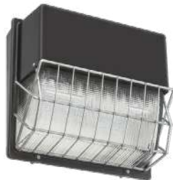
WG - Wire guard