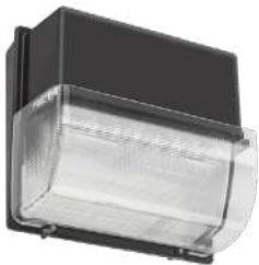
VG - Vandal guard